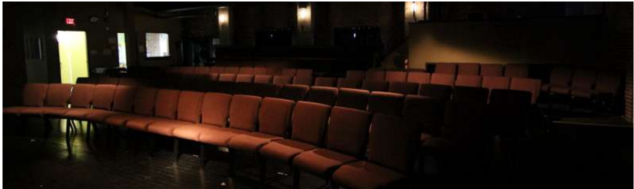
The BMO Studio Theatre