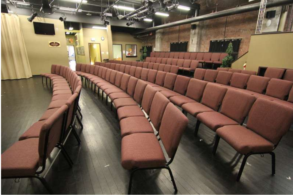
Theatre (seating for 100)