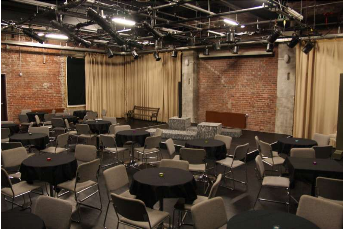
Cabaret (seating for 80)