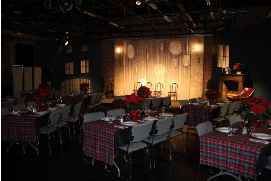
Dinner (seating for 60)