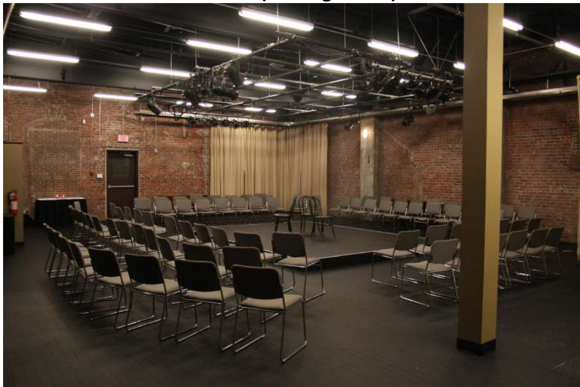
In-the-Round (seating for 100)