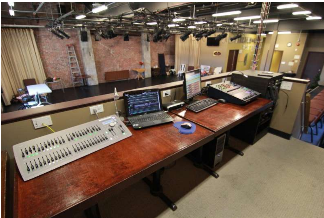
Sound and Lighting Booth