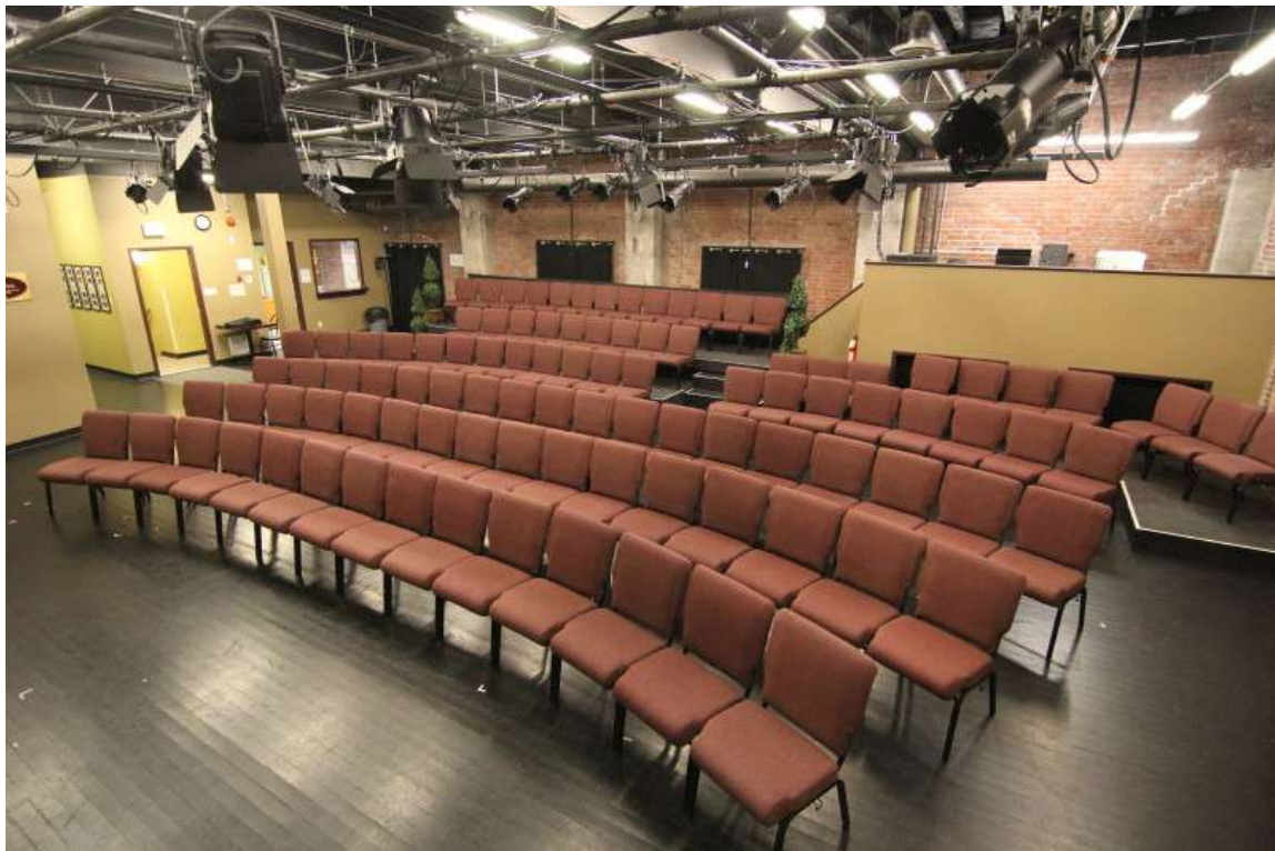
Theatre (seating for 100)