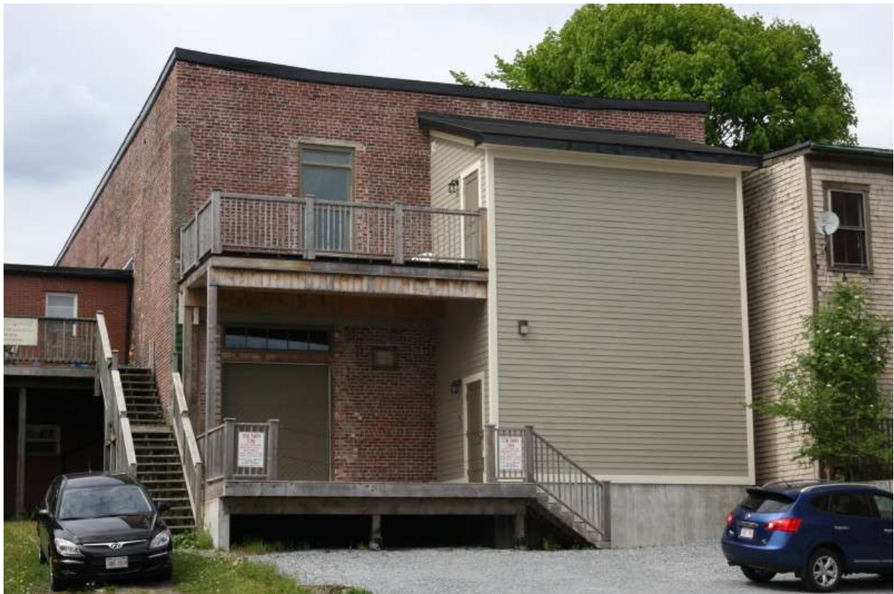
Loading Dock at Back of Building