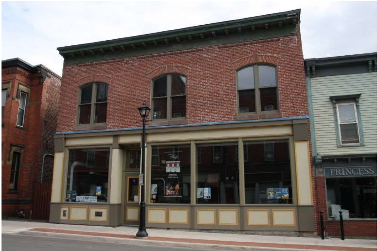
112 Princess St., Saint John, NB